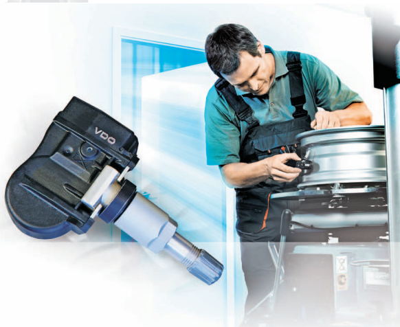
VDO REDI-Sensor makes TPMS service faster, easier and more profitable.

There's no doubt about it, TPMS service can be a real challenge. The lack of standardization and the wide variety of OE and aftermarket TPMS sensors now on the market is creating a lot of confusion and increasing the financial burden on shops like yours. Many of these sensors require distinct RF protocols and use separate modes of operation. Some sensors are supplied as blanks and need to be programmed first, before they are installed. All this means is that you'll need to buy specialized scan tools and expensive software updates as well as follow a lot of different relearn procedures in order to be able to properly service the wide variety of TPMS systems currently on the road.